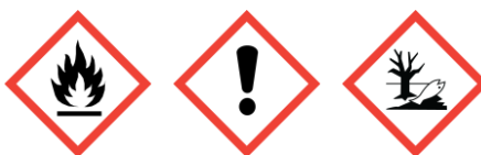
GHS02 GHS07 GHS09